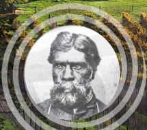
King Co-Co Coine of the Warriors

Stone walling still divides dairy & crop farms. Small settlements and the early "Squatters" rambling old mansions dot the rolling hills & plains.